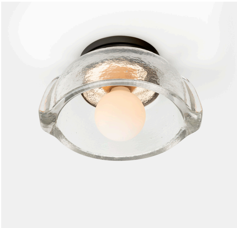
Shown with Polished Bronze disc, Otter canopy and Clear Glass with Cast Texture interior