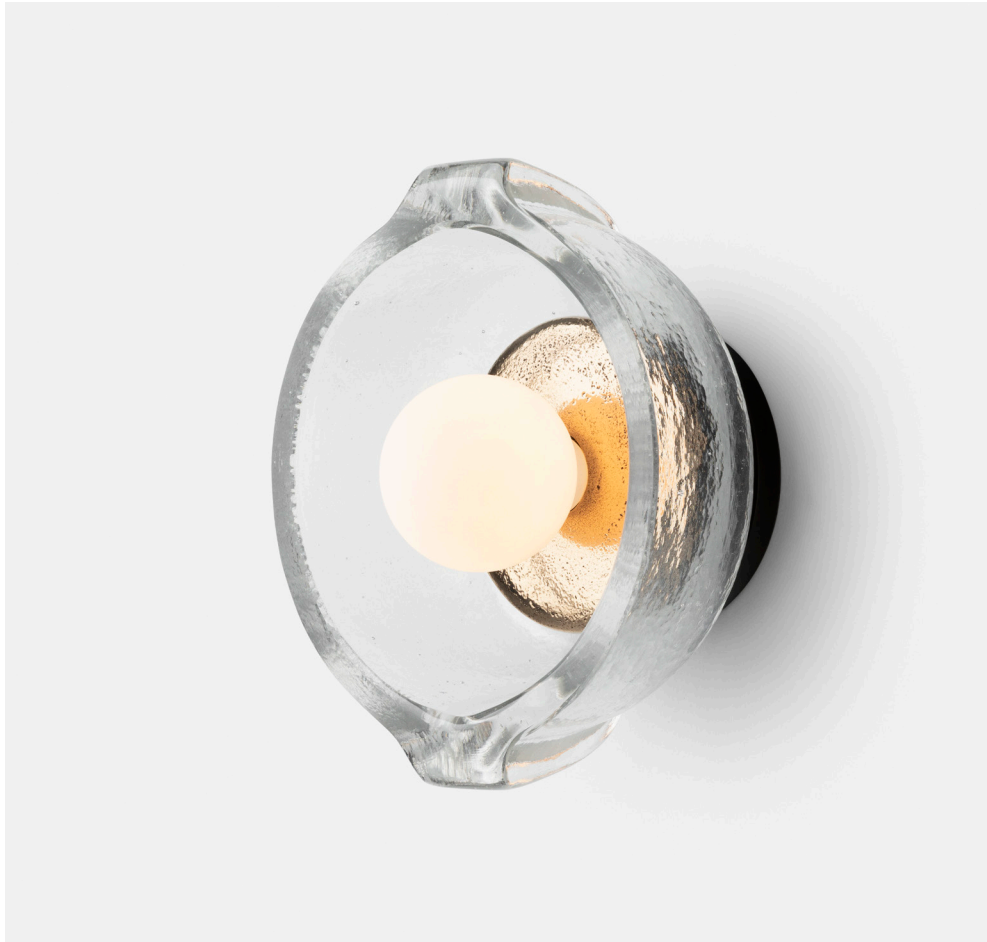
Shown with Polished Bronze disc, Otter back plate and Clear Glass with Cast Texture interior