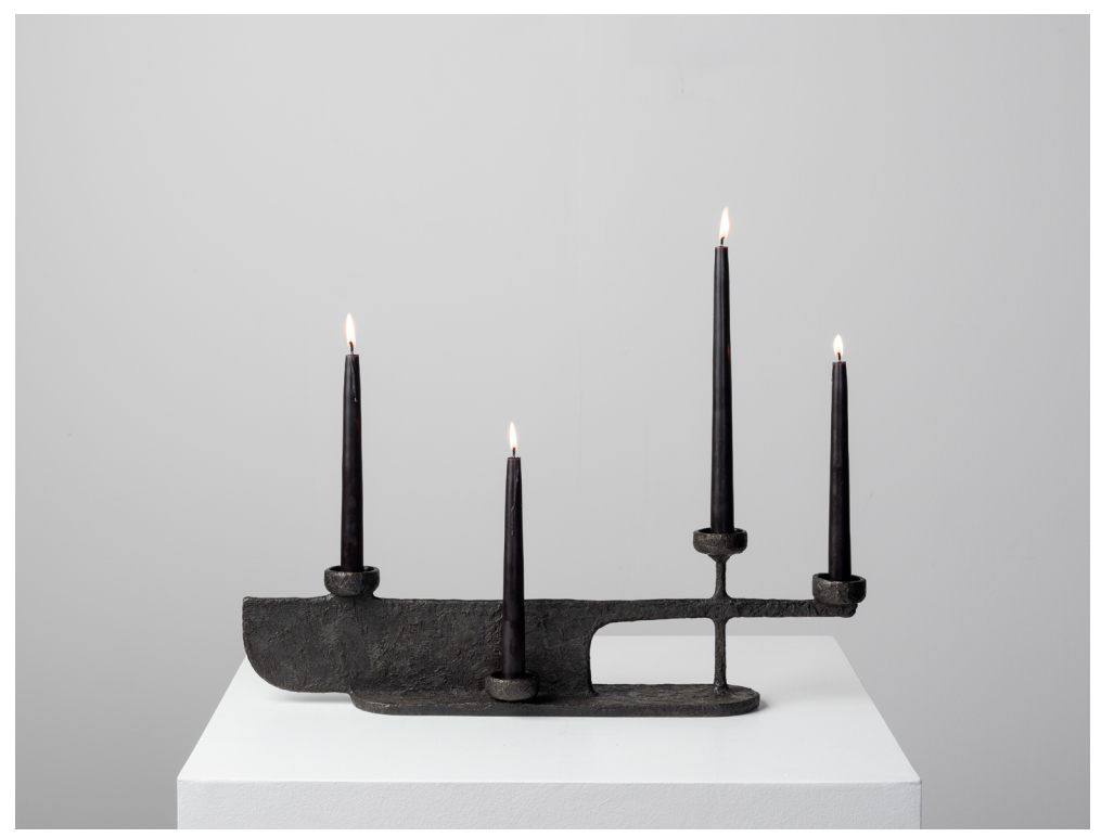
Shown in Otter Bronze