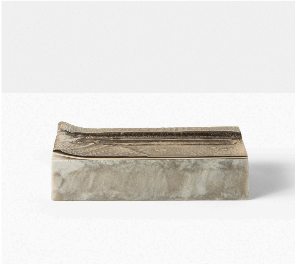
Shown in Moonscape cast mineral with Polished bronze