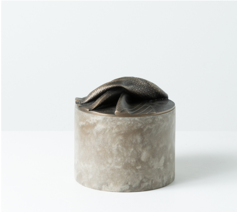
Shown in Moonscape cast mineral with Cinder bronze