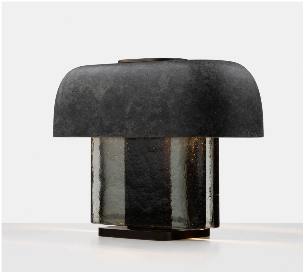
Shown in Trailhead cast mineral shade, Shale cast glass lamp base, and Statuary milled bronze