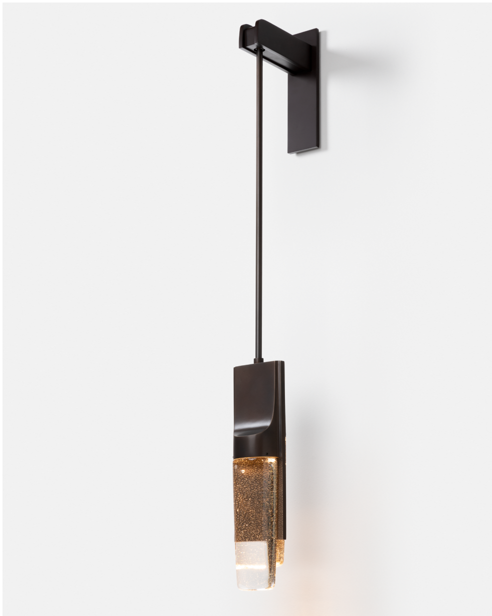
Shown in Otter bronze and Clear glass with Hand Polished lenses