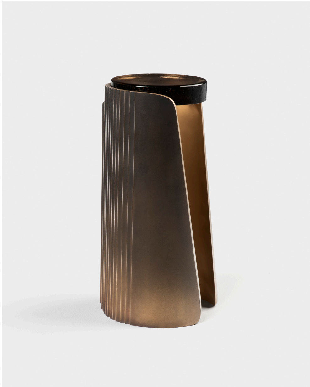
Shown in Otter Bronze with gradient effect and Suede Glass