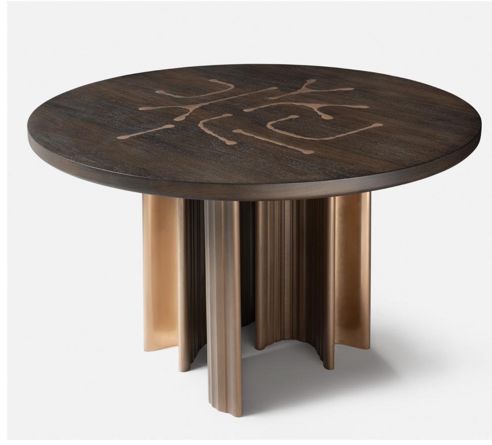
Shown in Natural Bronze and Clove Walnut with Burnished Inlay Shown with custom 52" diameter top