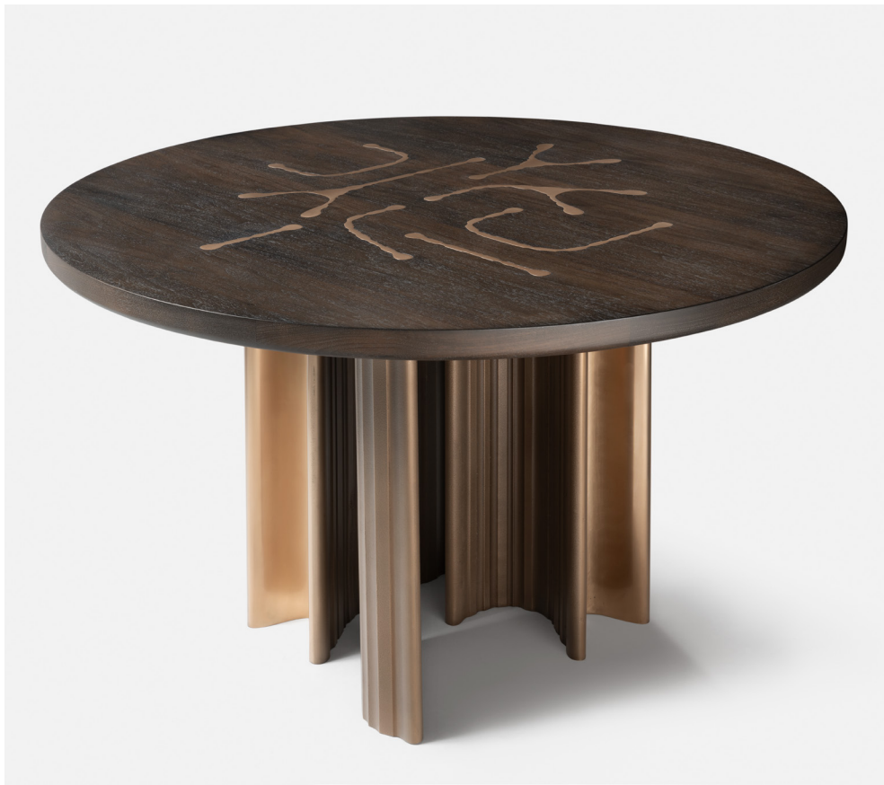
Shown in Natural Bronze and Clove Walnut with Burnished Inlay Shown with custom 52" diameter top